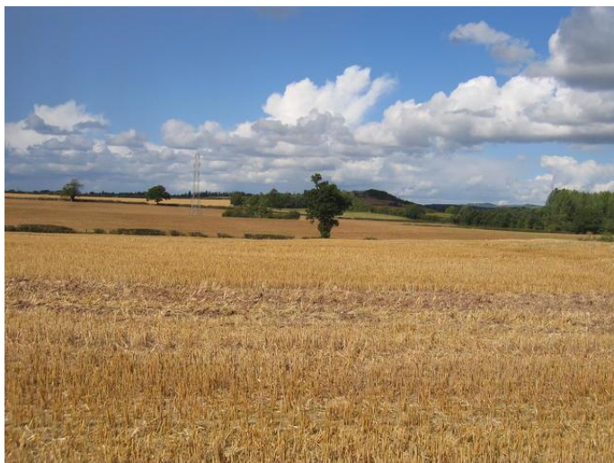
View towards Fibden farm c.2010