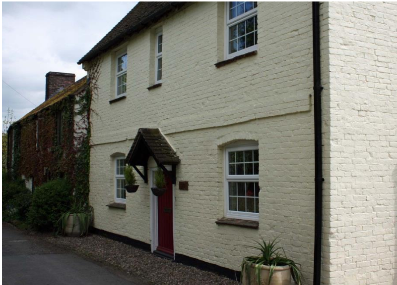
Lower End Farm, Birlingham, 2010