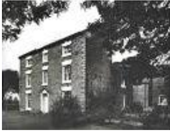
Top Farm Cleeve Prior c.1950