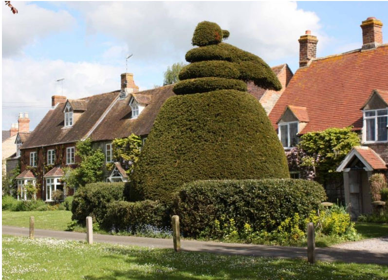
Cleeve Prior 2010