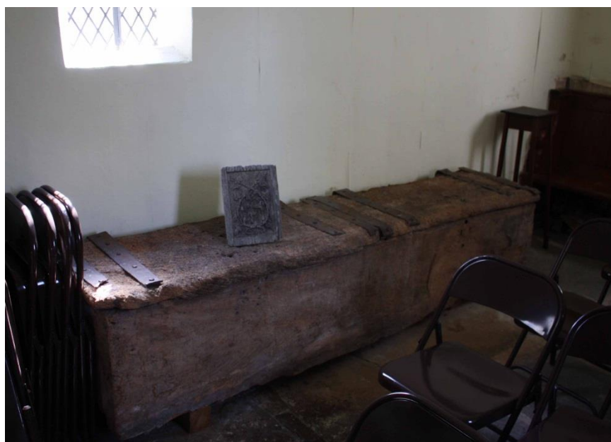
Cleeve Prior – Parish chest, 2010