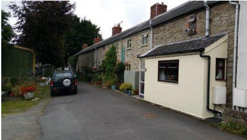
Sunset Row, Kington c.2015