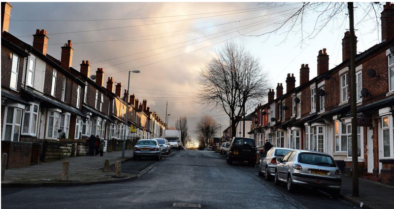
James Turner Street, Birmingham (c.2015)