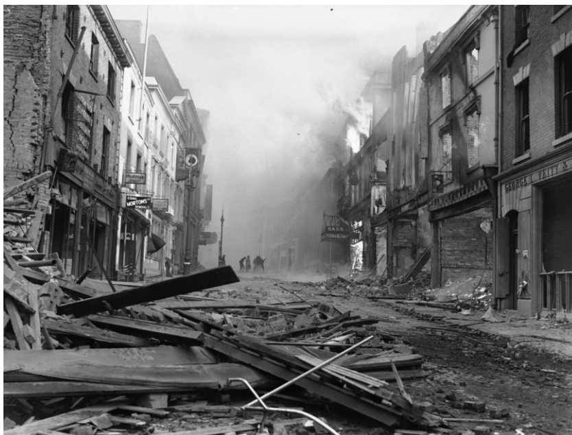
Queen's Hotel Coventry bombed – November 1940