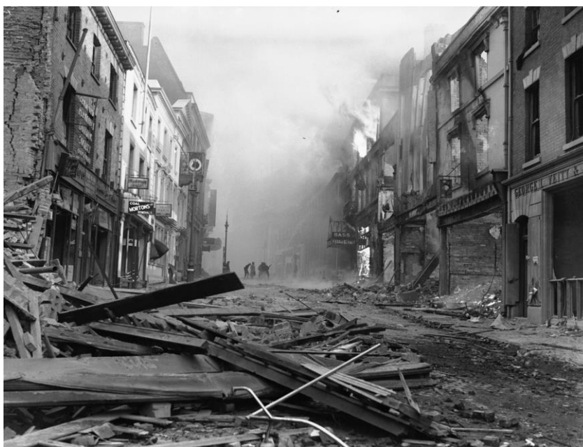
Queen's Hotel Coventry bombed – November 1940

The Queen's Hotel was destroyed in the bombing of Coventry on the nights of the 14/15 th November 1940 – this destroyed most of the centre of the city and the Cathedral.