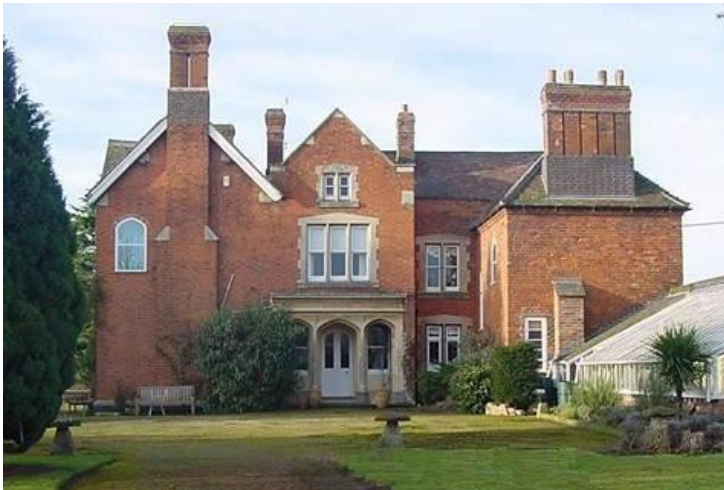
Spring Hill Farm House c.2010