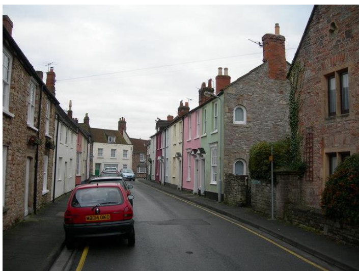
St John's Street, Wells c.2015