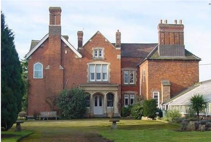
Spring Hill Farm House c.2010