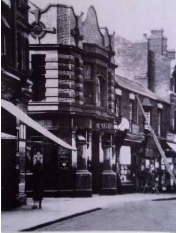
Evesham Street, Redditch, c.1890. At the left is on the corner is 32 Evesham Street.