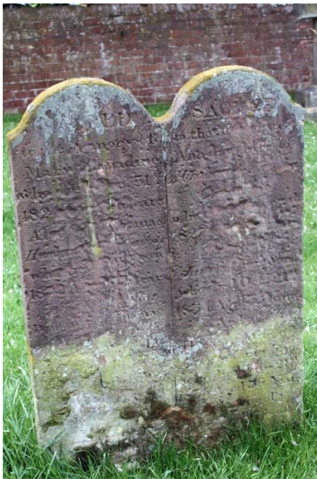
Holy Trinity, Belbroughton

A memorial at Belbroughton (eroded) gives some information about the family.