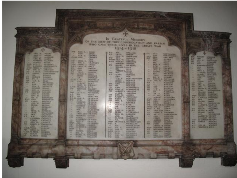
Nottingham War Memorial