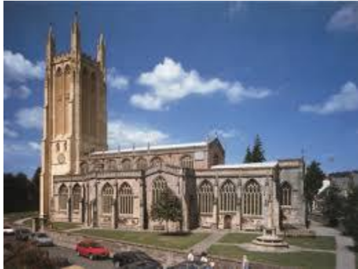
St. Cuthbert, Wells c.2010